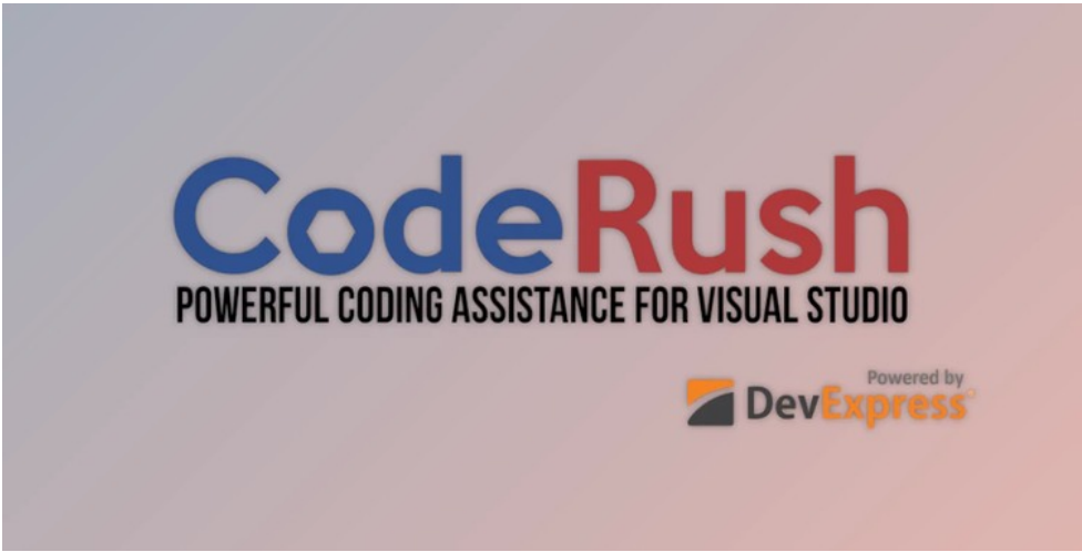
DevExpress CodeRush v25.2.3 (18 Dec 2025) + Patcher